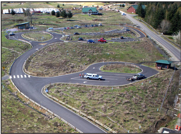
Aerial Photo of Visitor Center (top left) & Parking Lot